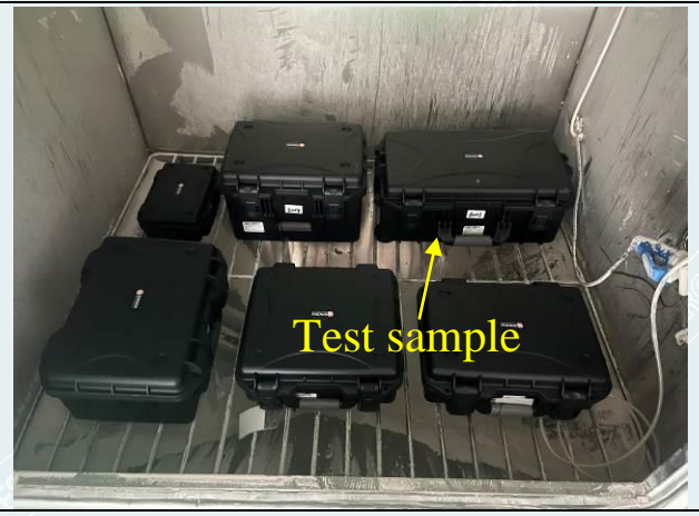
Fig.1-6 Test sample placement