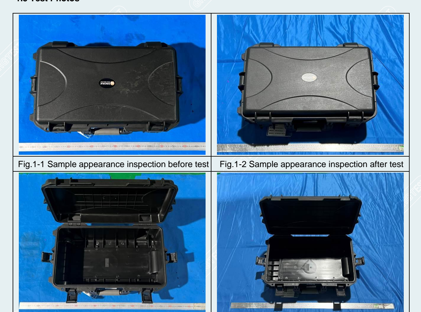
Fig.1-3 Sample appearance inspection before test